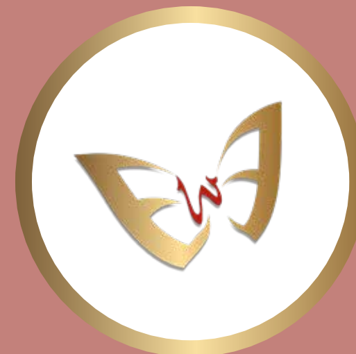
Emirates Women Subgroup