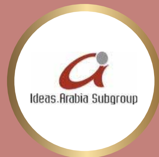
Ideas Arabia Subgroup