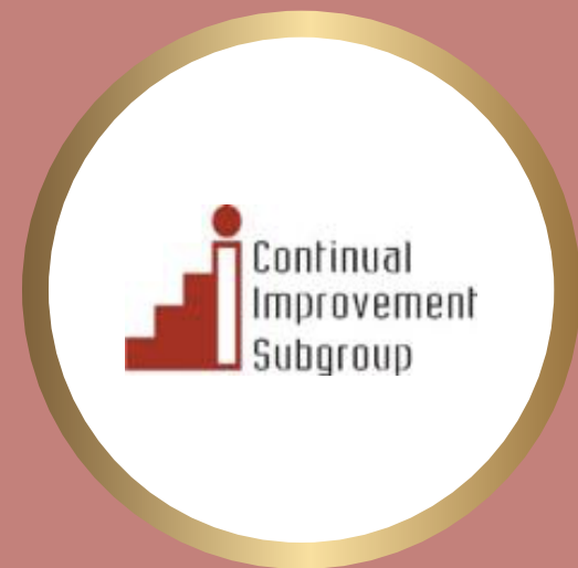
Continual Improvement Subgroup