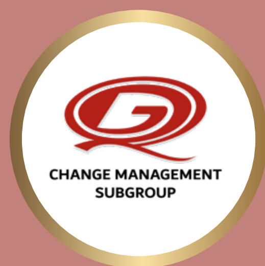
Change Management Subgroup